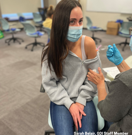
GDI COMMUNICATOR - PAGE 3